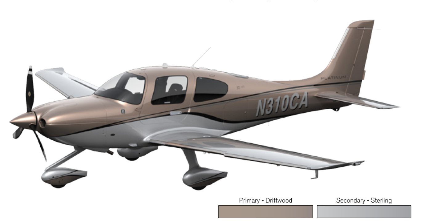
DRIFTWOOD / STERLING