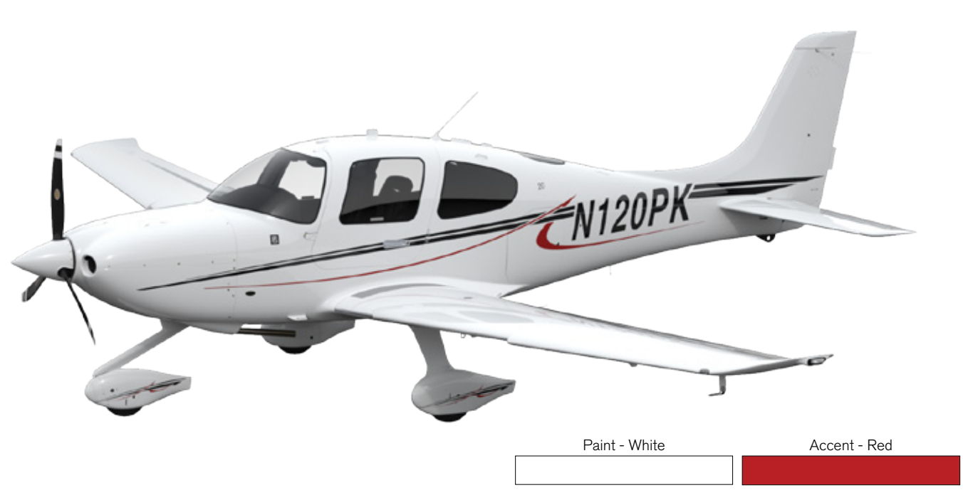
TUNGSTEN + RED