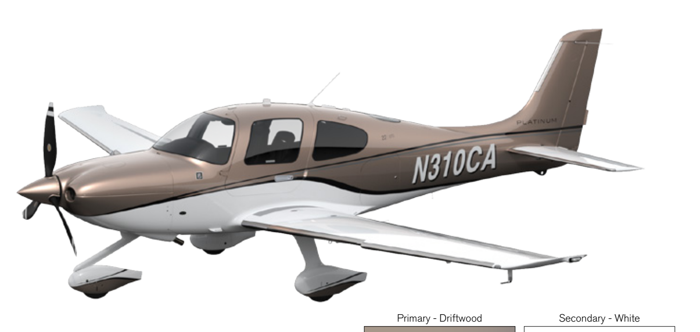
DRIFTWOOD / WHITE