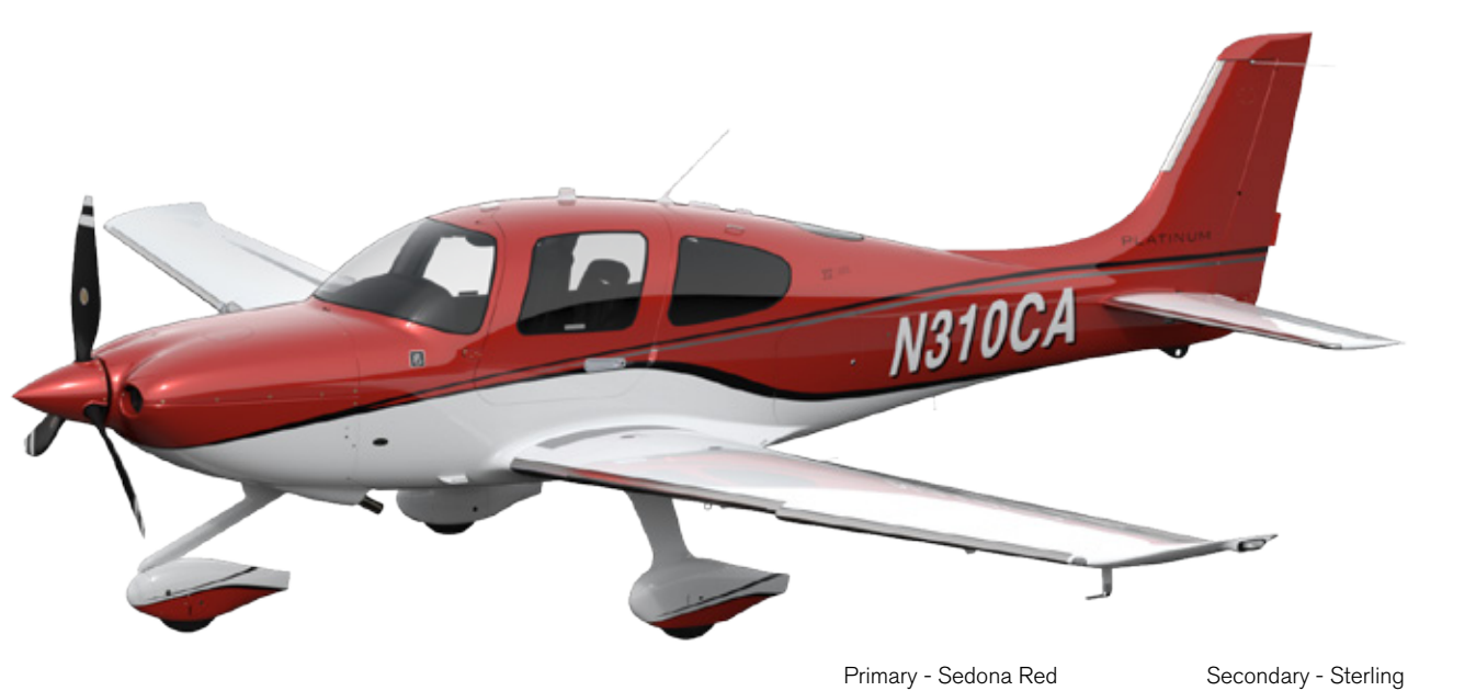
Primary - Sedona Red