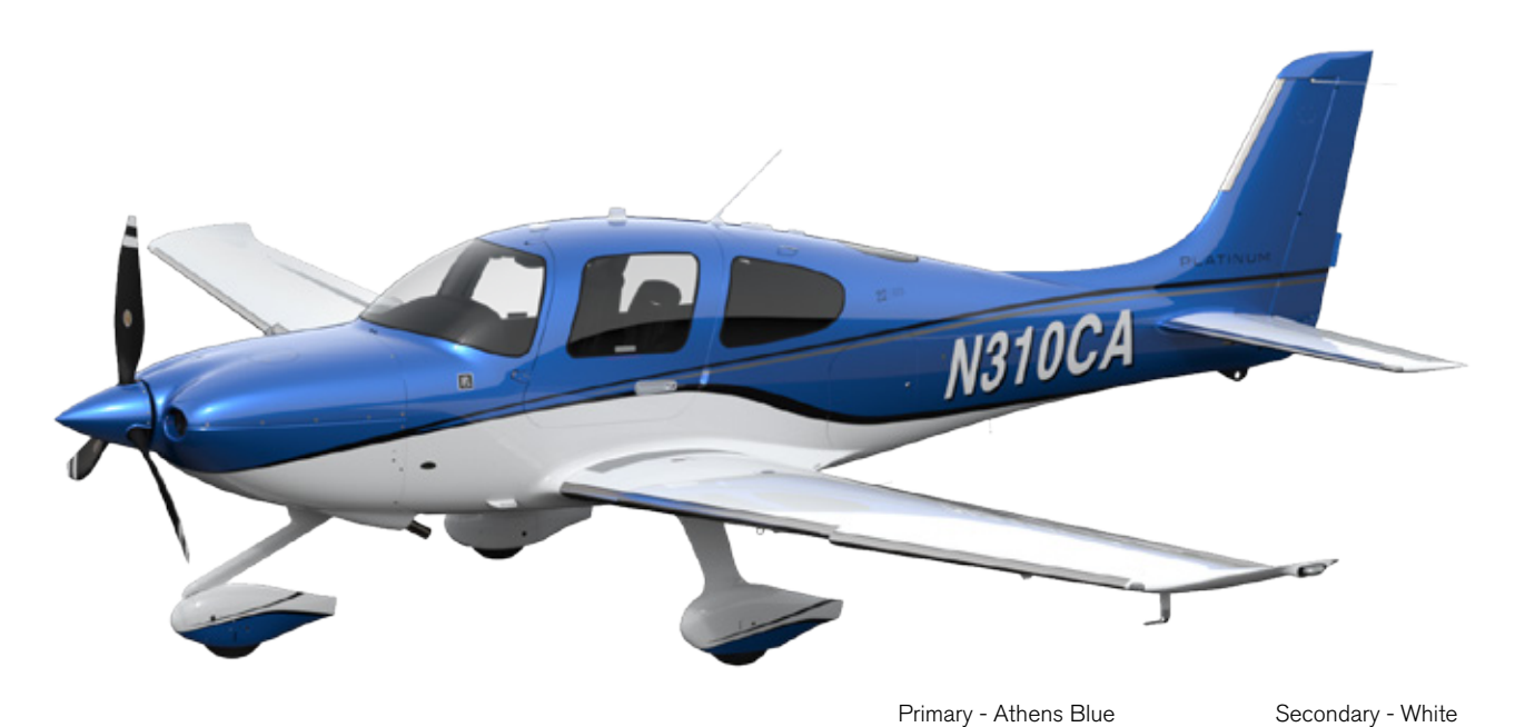
ATHENS BLUE / WHITE