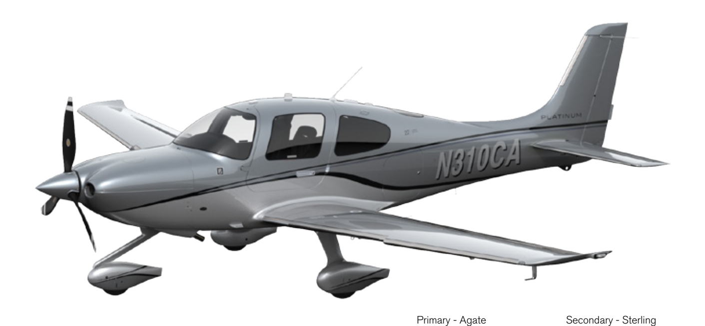
AGATE / STERLING