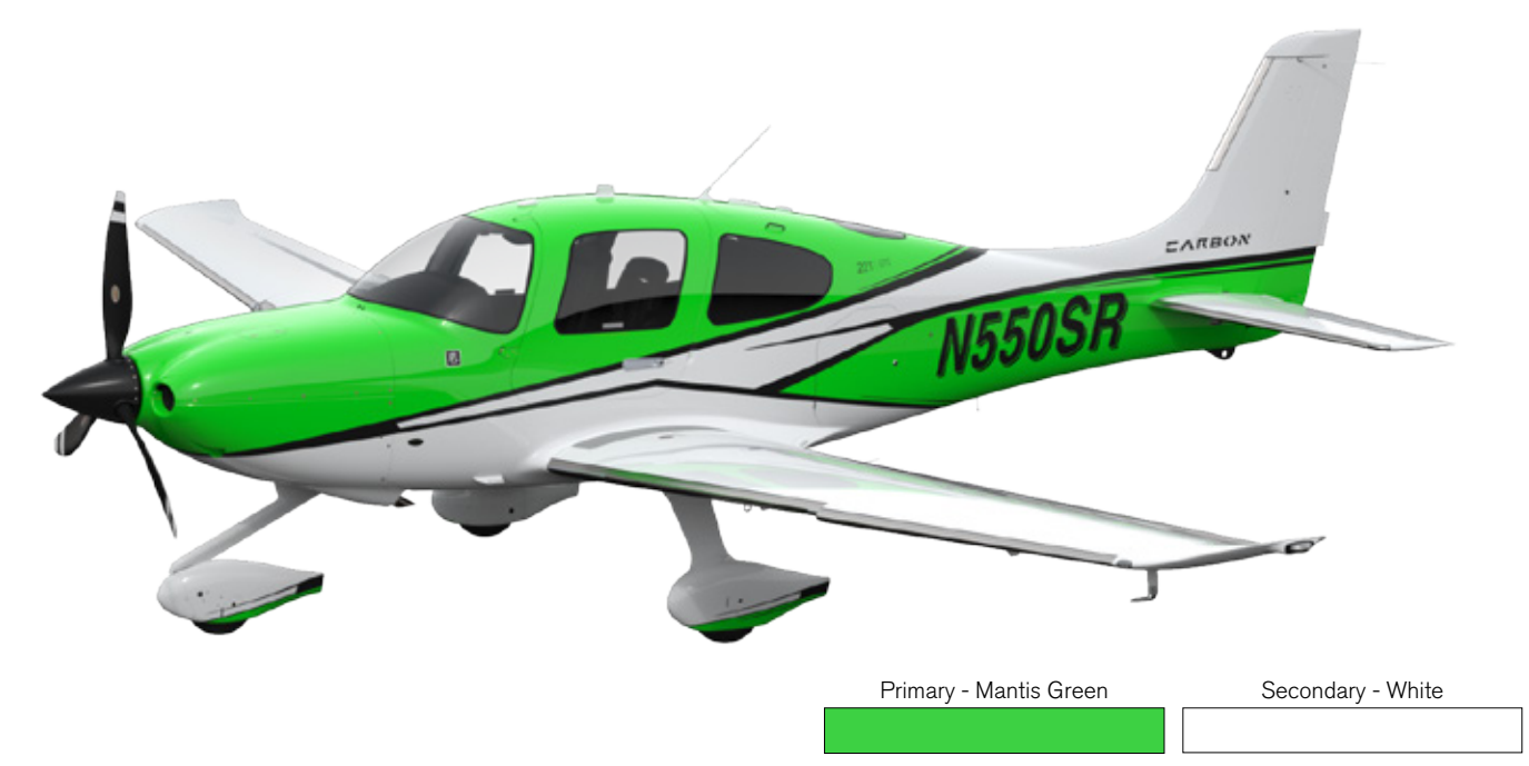
MANTIS GREEN / WHITE