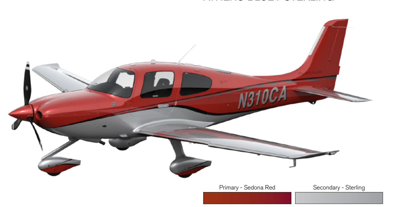
SEDONA RED / STERLING