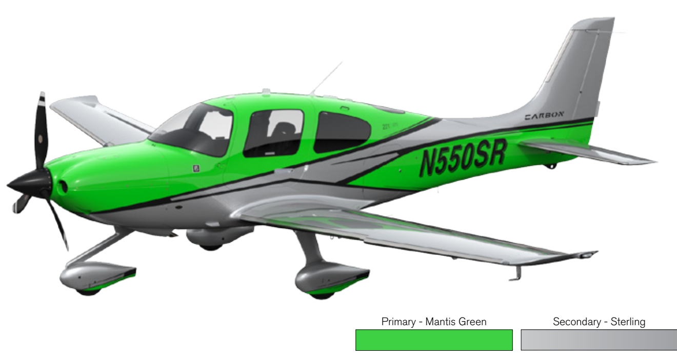
MANTIS GREEN / STERLING