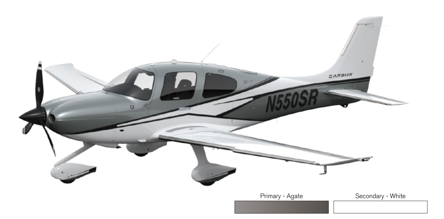
AGATE / WHITE