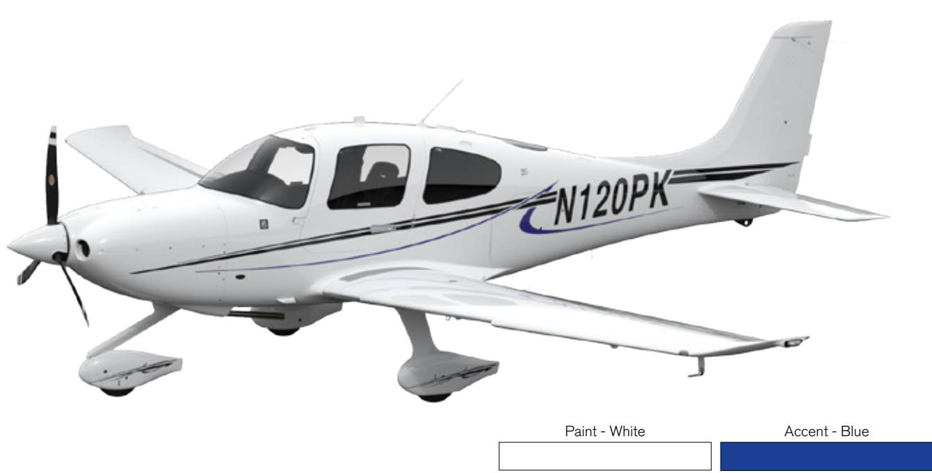
TUNGSTEN + BLUE