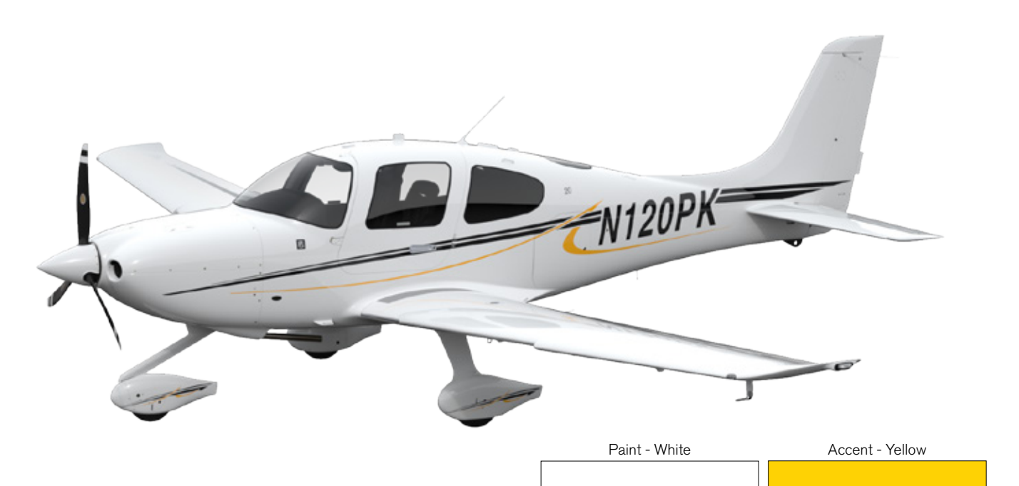
TUNGSTEN + YELLOW