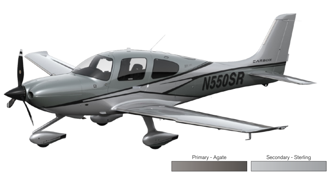
AGATE / STERLING