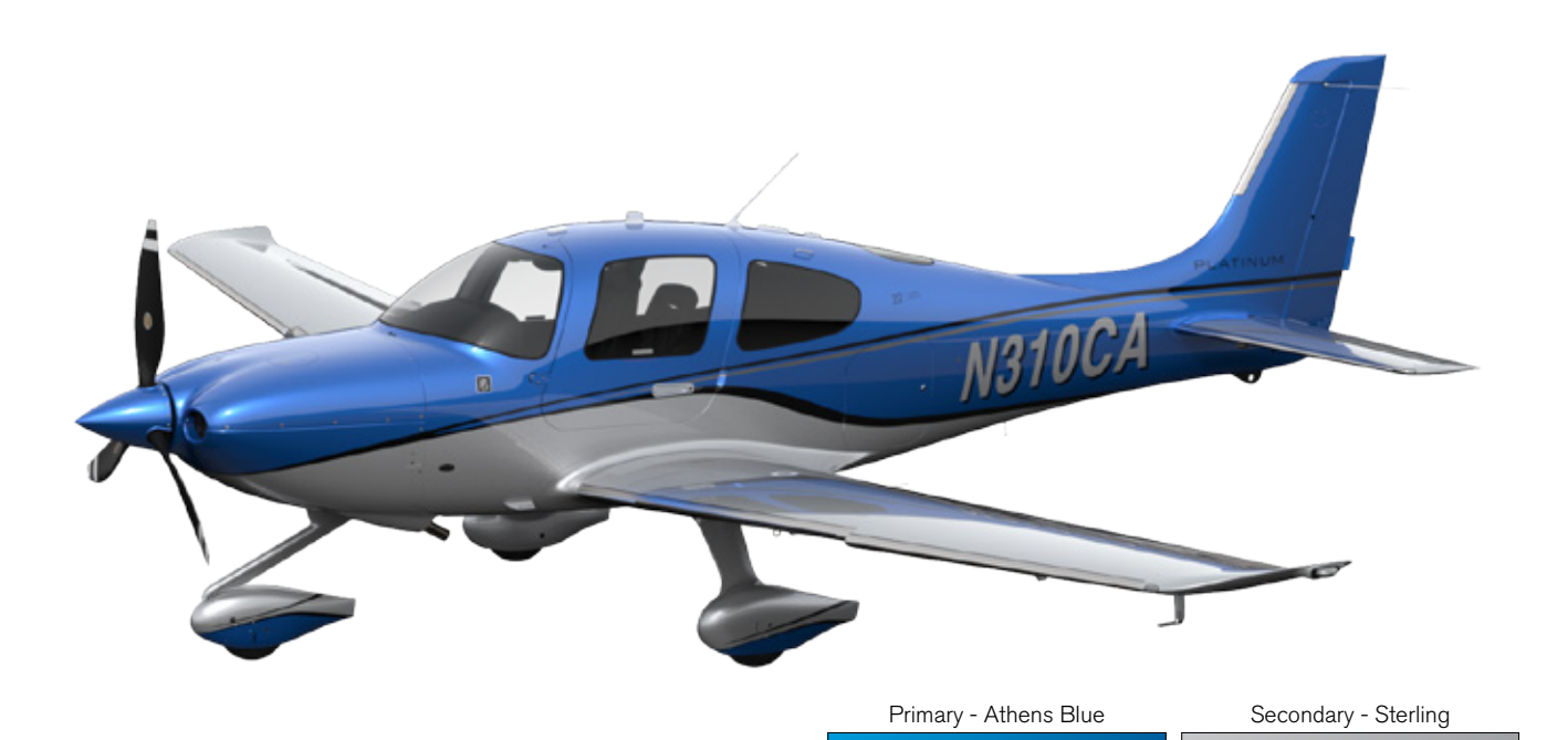
ATHENS BLUE / STERLING