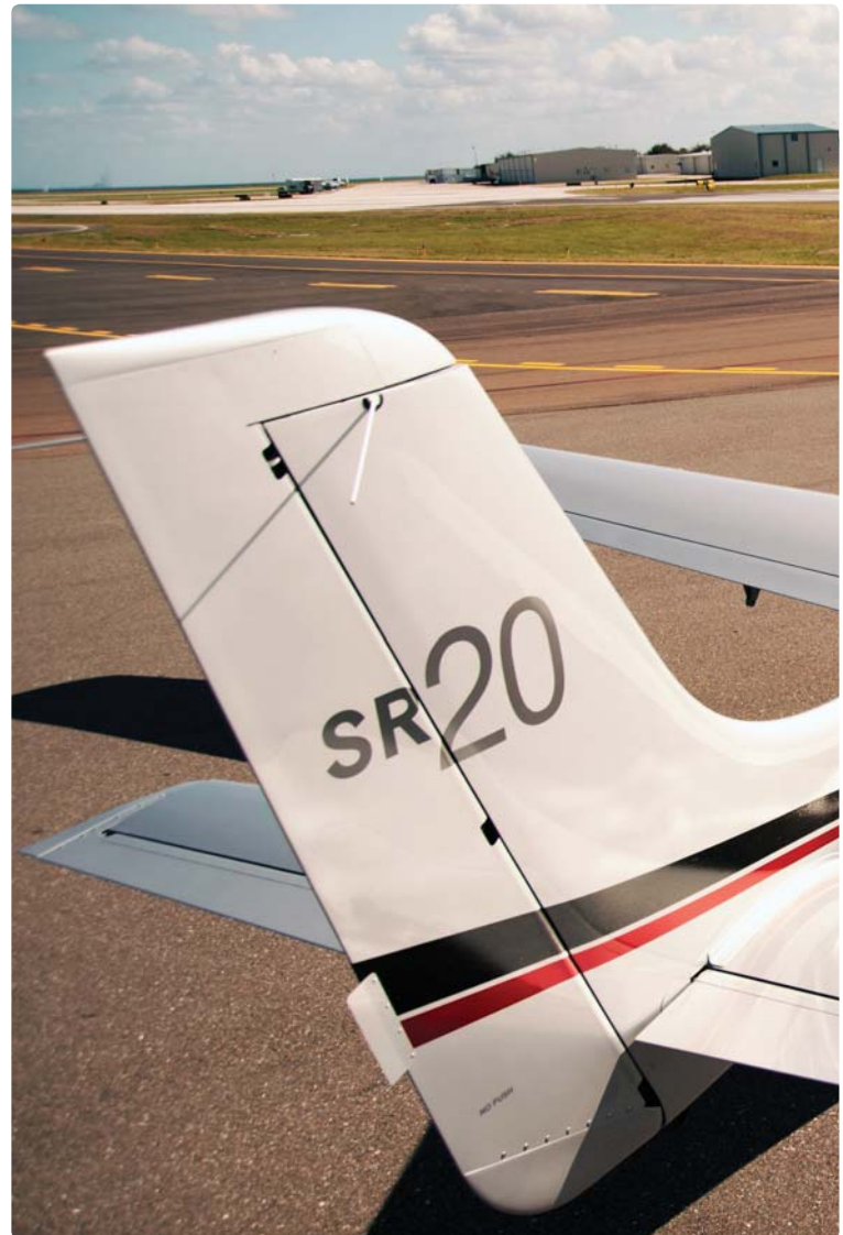
SR20 High Speed Cruise @ 8,000 Ft (155 KTAS)