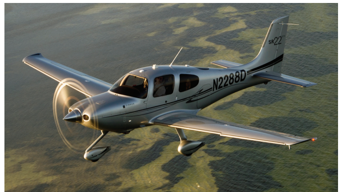
SR22 High Speed Cruise @ 8,000 Ft (180 KTAS)