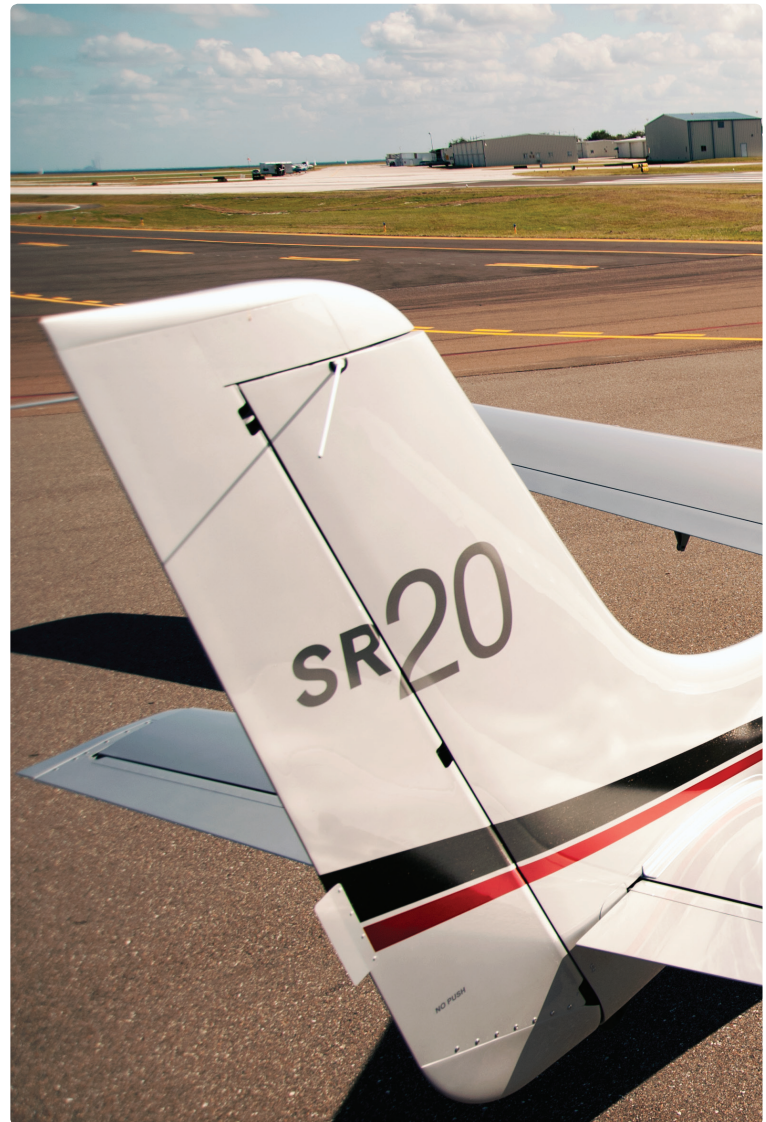
SR20 High Speed Cruise @ 8,000 Ft (155 KTAS)