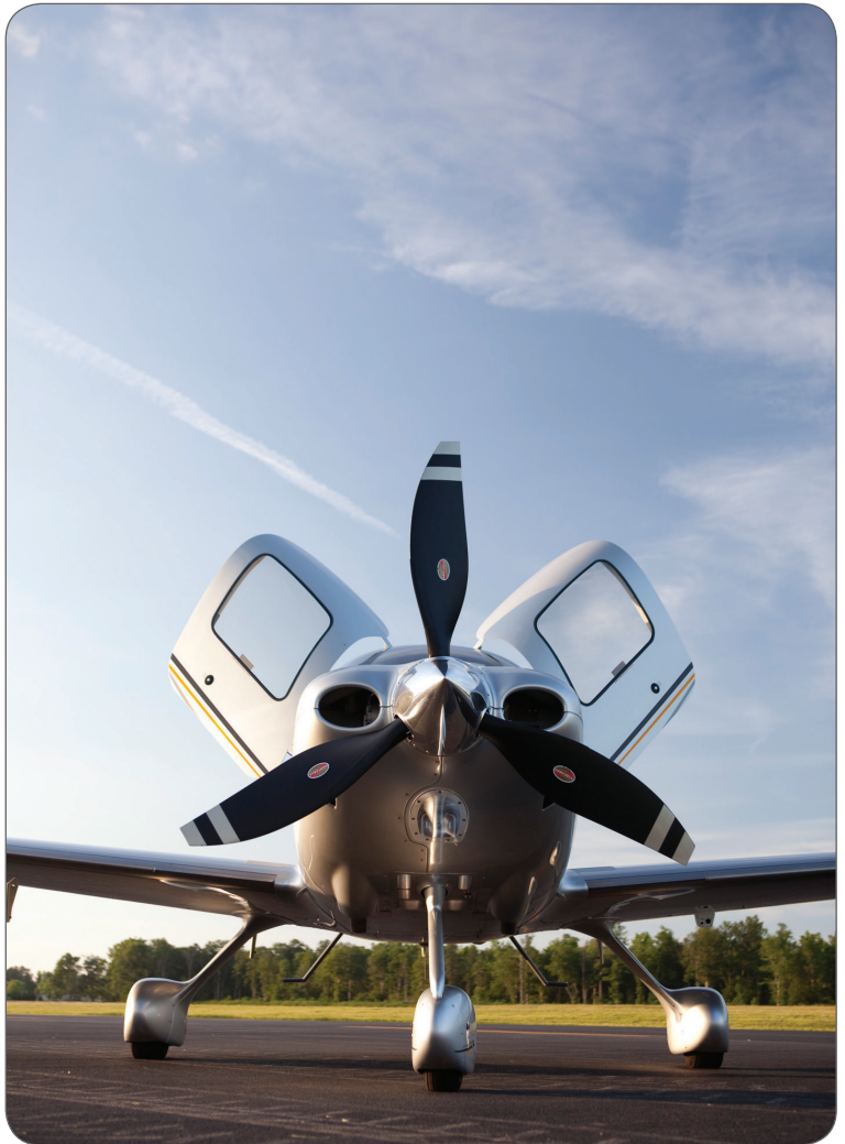
SR22T High Speed Cruise @ 18,000 Ft (200 KTAS)