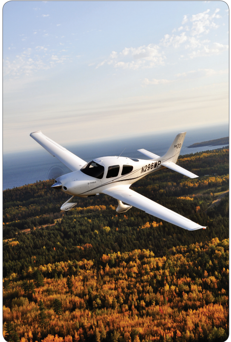
SR20 High Speed Cruise @ 8,000 Ft (155 KTAS)