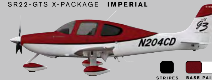
SR22-GTS X-PACKAGE IMPERIAL