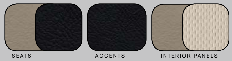
SR22-G3 SAND & ONYX