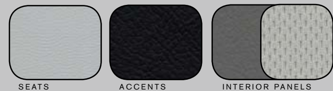
SR22-GTS LIGHT GREY