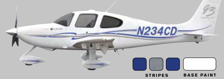
SR22-G3 LAPIS BLUE