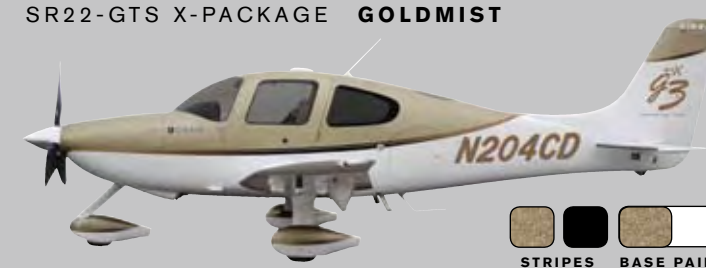
SR22-GTS X-PACKAGE GOLDMIST