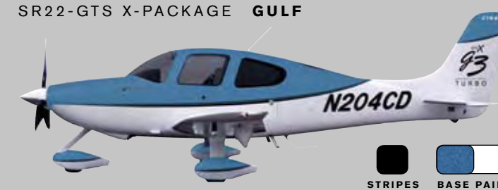
SR22-GTS X-PACKAGE GULF