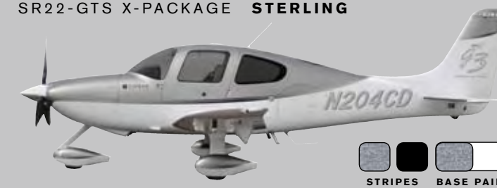
SR22-GTS X-PACKAGE STERLING