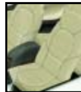
feather beige leather