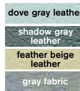
dove gray leather