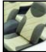
feather beige & shadow gray leather