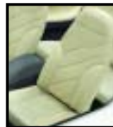
feather beige leather