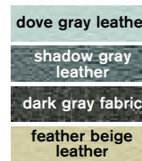
dove gray leather