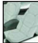
dove gray leather