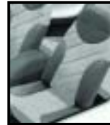
fabric with shadow trim