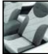
dove gray & shadow gray leather