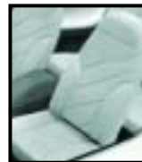
dove gray leather