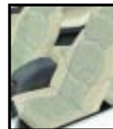
feather beige leather & fabric