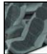
shadow gray leather & fabric