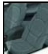
shadow gray leather